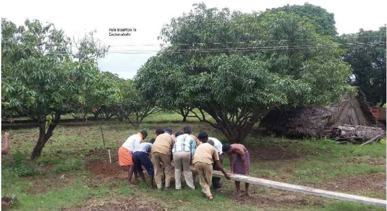
Pole Insertion in Centrenahelly