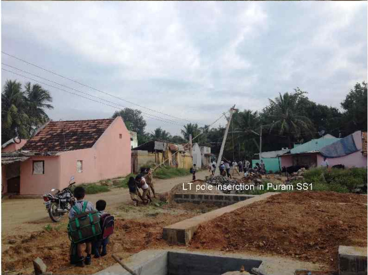
LT pole insertion in Puram SS1