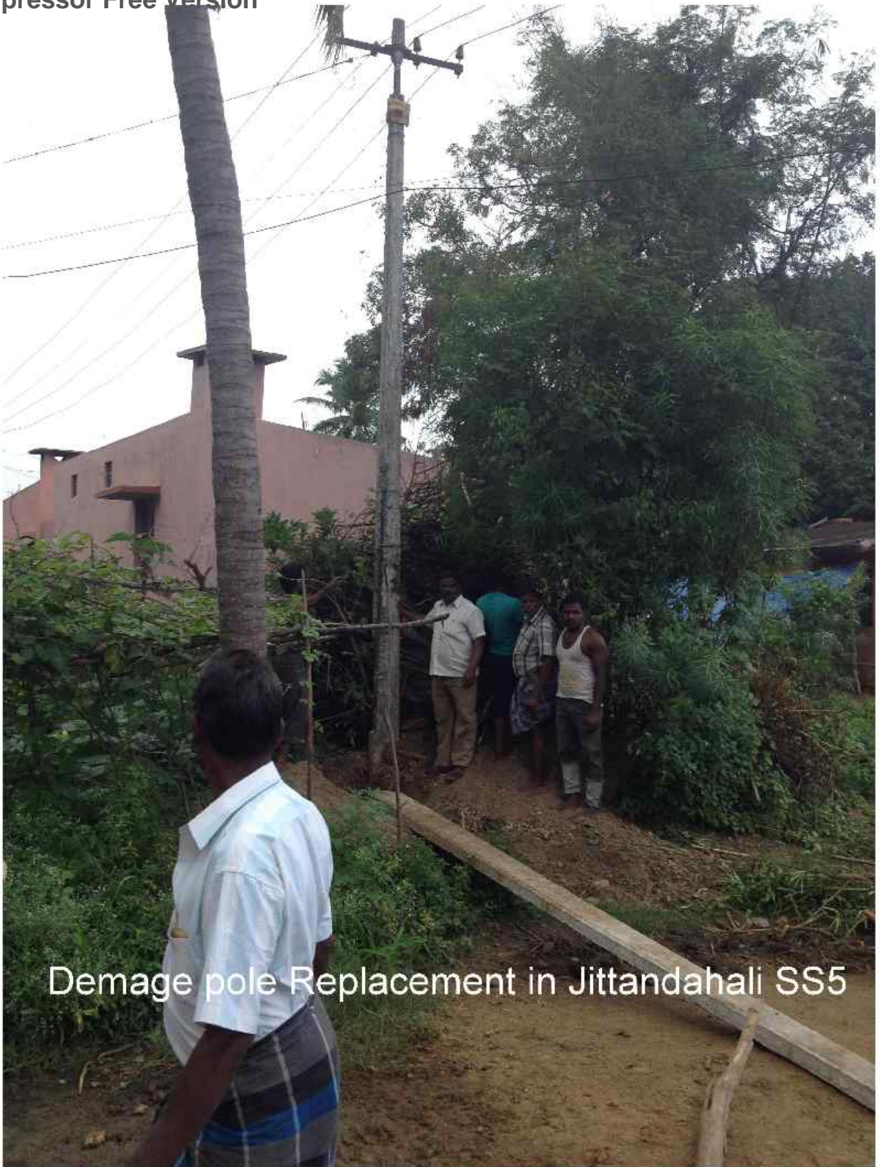
Demage pole Replacement in Jittandahali SS5