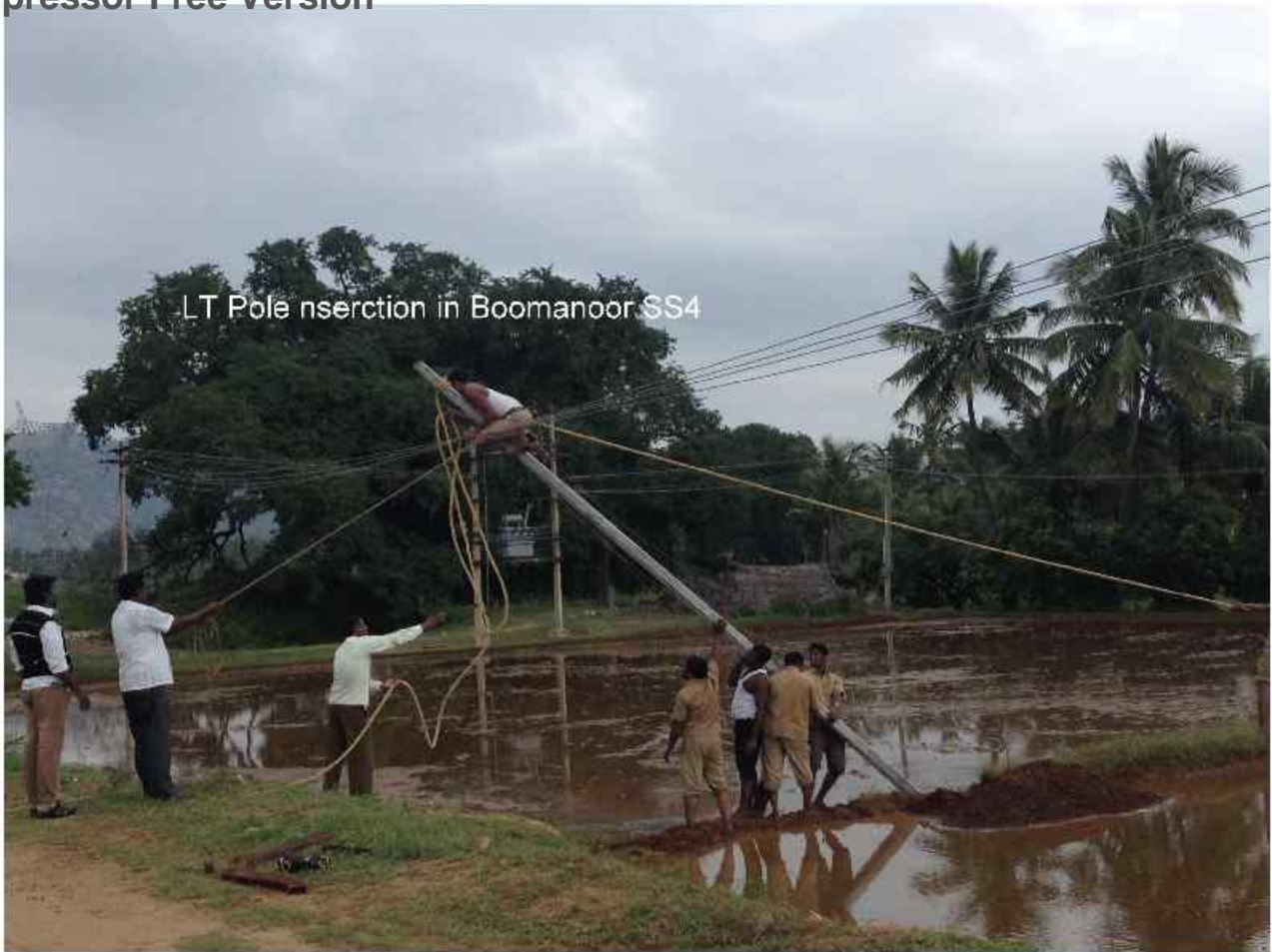
LT Pole nserction in Boomanoor SS4