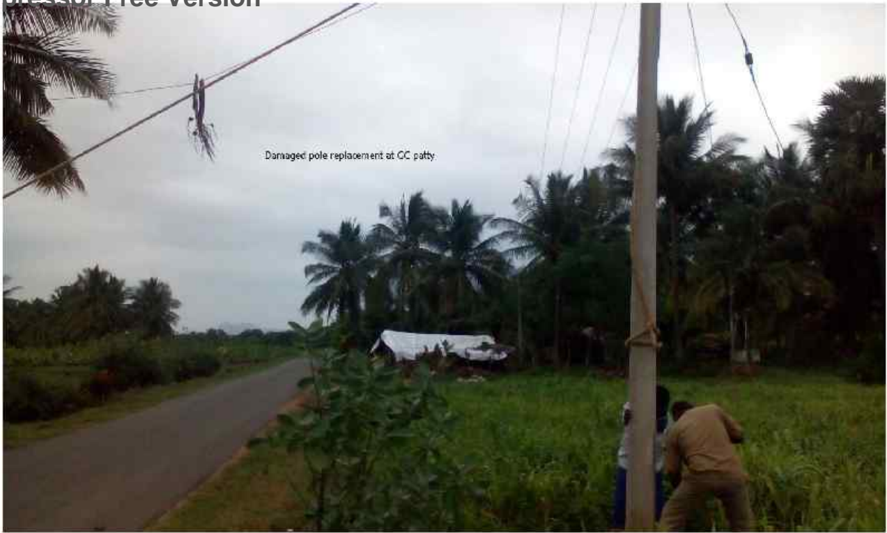
Damaged pole replacement at GC patty.