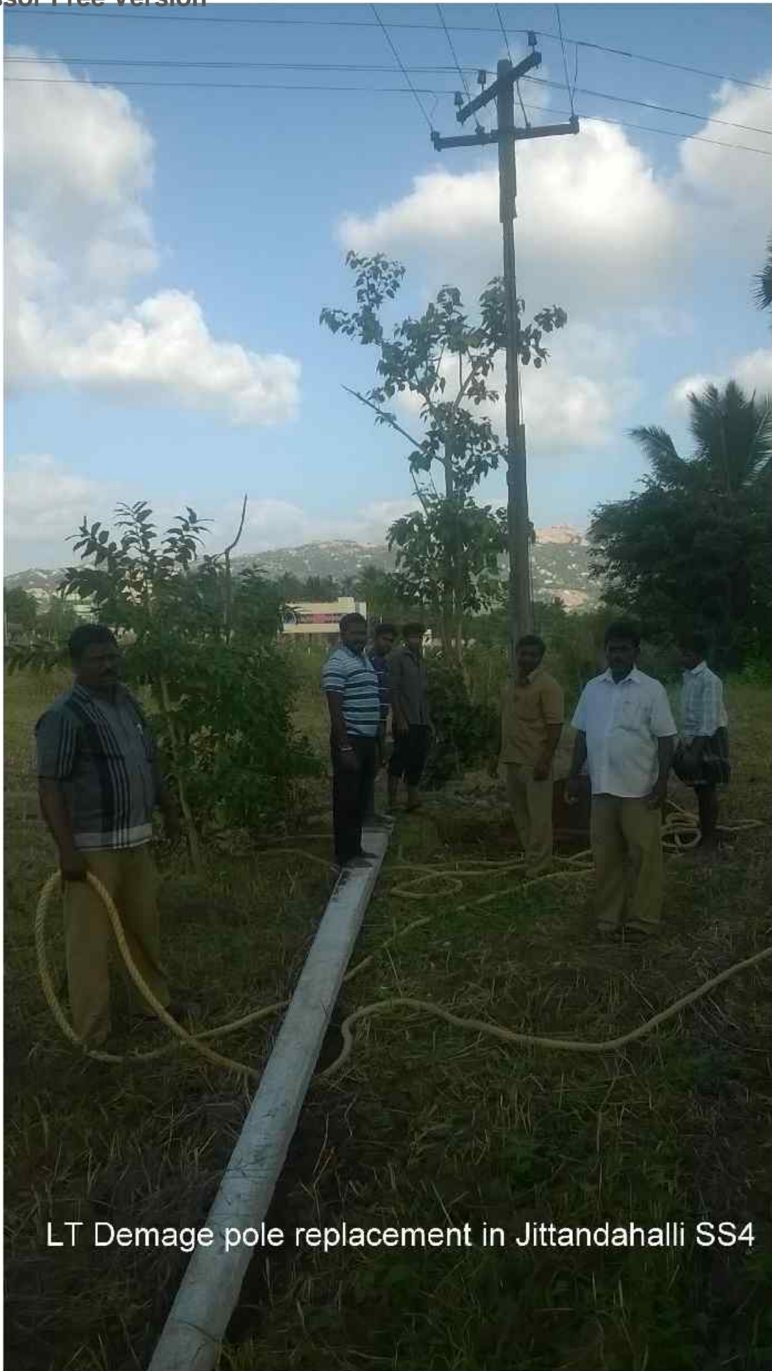
LT Damage pole replacement in Jittandahalli SS4