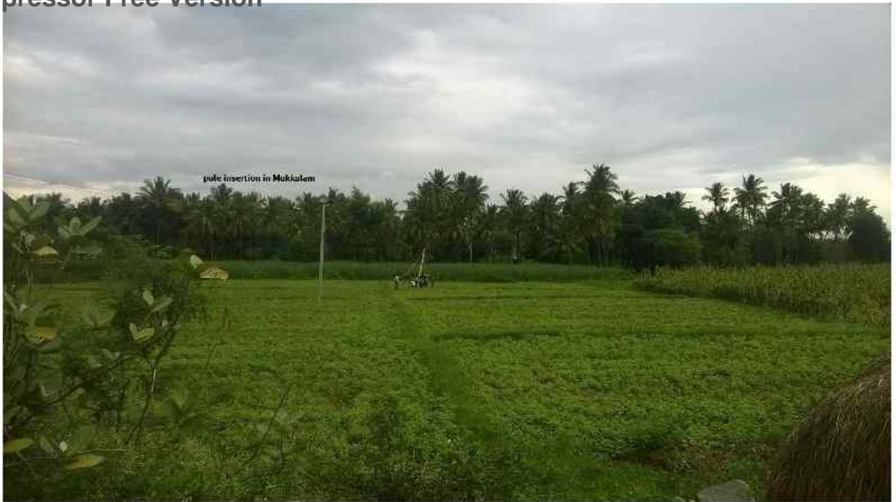
photo insertion in Mukkulam