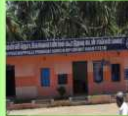
பாதிக்கப்பட்ட நபர்களுக்கு தங்கும் வசதி