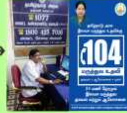
மாவட்ட கட்டுப்பாட்டு மையம்